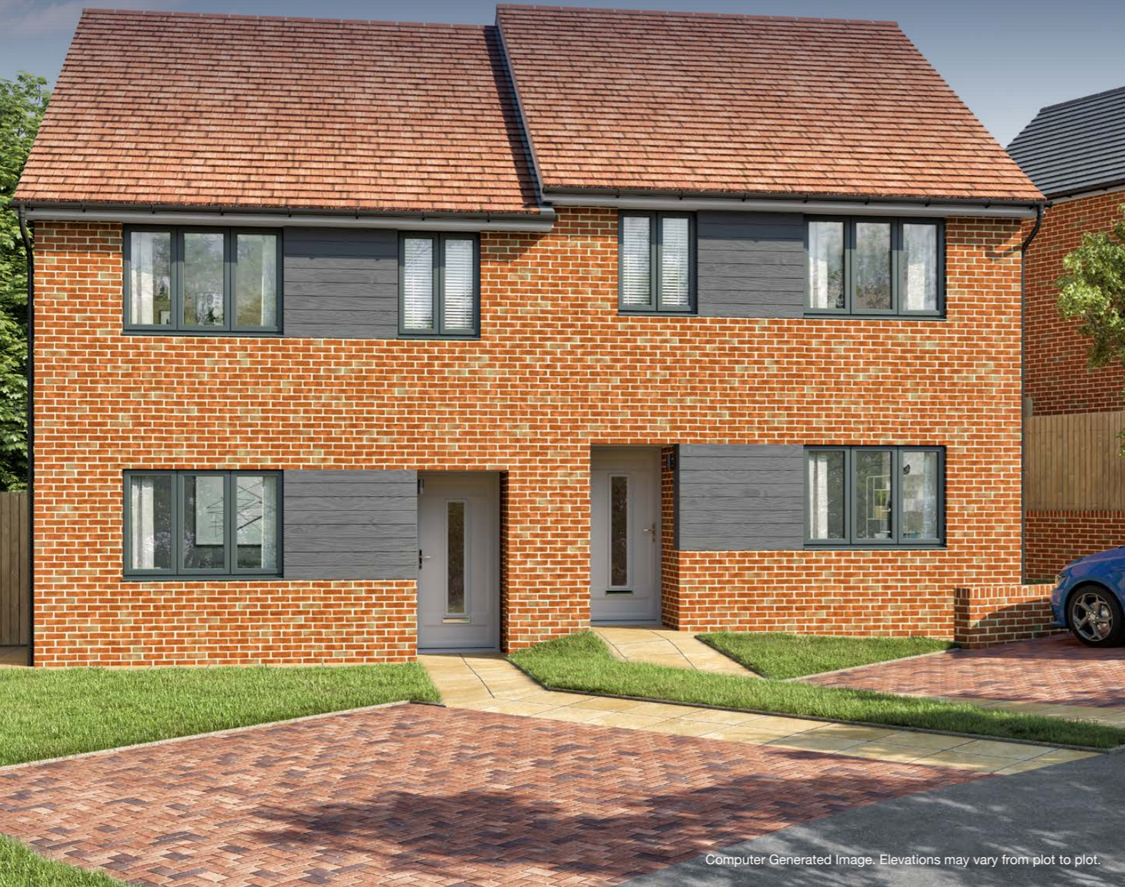
Computer Generated Image. Elevations may vary from plot to plot.

Market Sale 9, 10, 23, 25, 27, 37, 62, 71 and 83